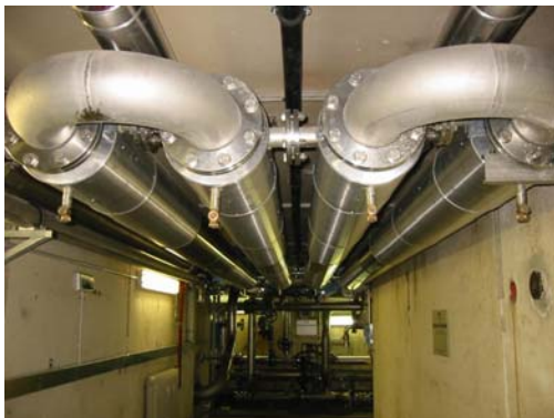
Sludge Heat Exchangers