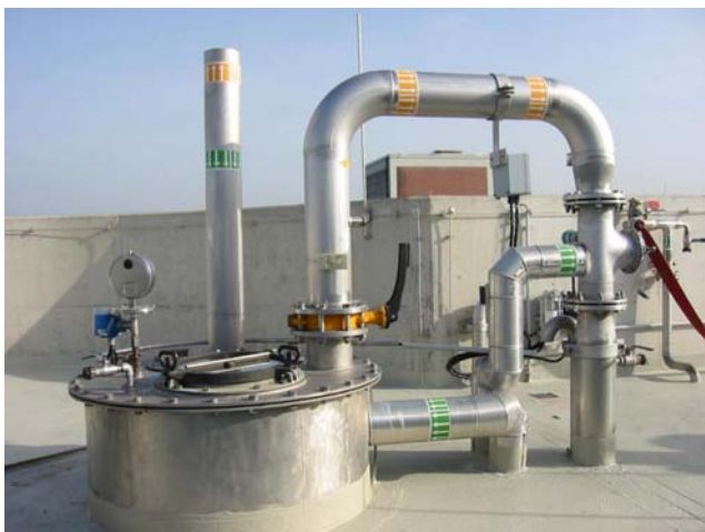
Gas Dome with pressure safety device