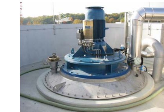
Gas Hood for draft tube mixer installation